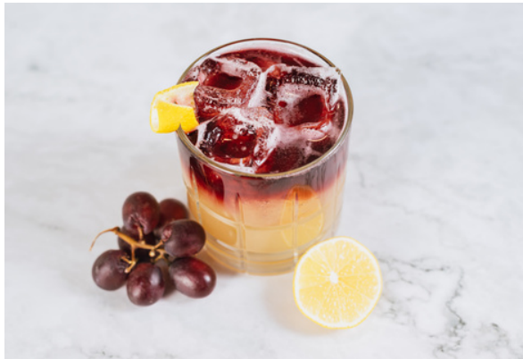
New York Sour