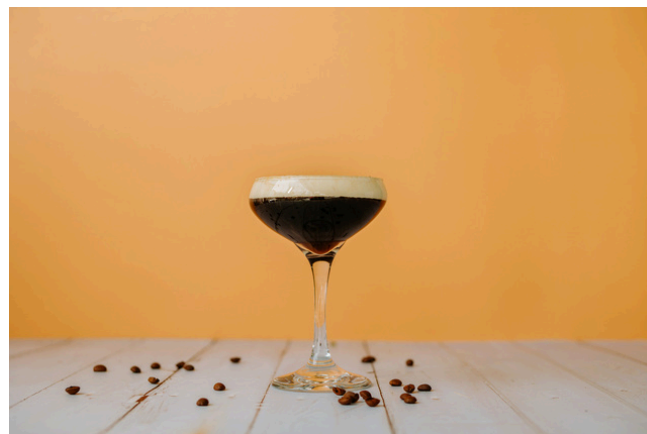
Wake Me Up Before You Cocoa

El Guapo $6.00 anejo tequila | crème de cacao | cinnamon syrup | bitters