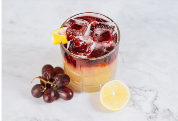
New York Sour