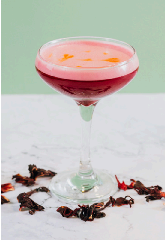
Roses Are Red