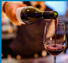
Table-Side Dinner Wine Service

At Peak Beverage, we value having a full-service bar that stands out from the crowd. We have various à la carte offerings that can be added to any of our packages! Reach out to our team for more details on our add-on services.