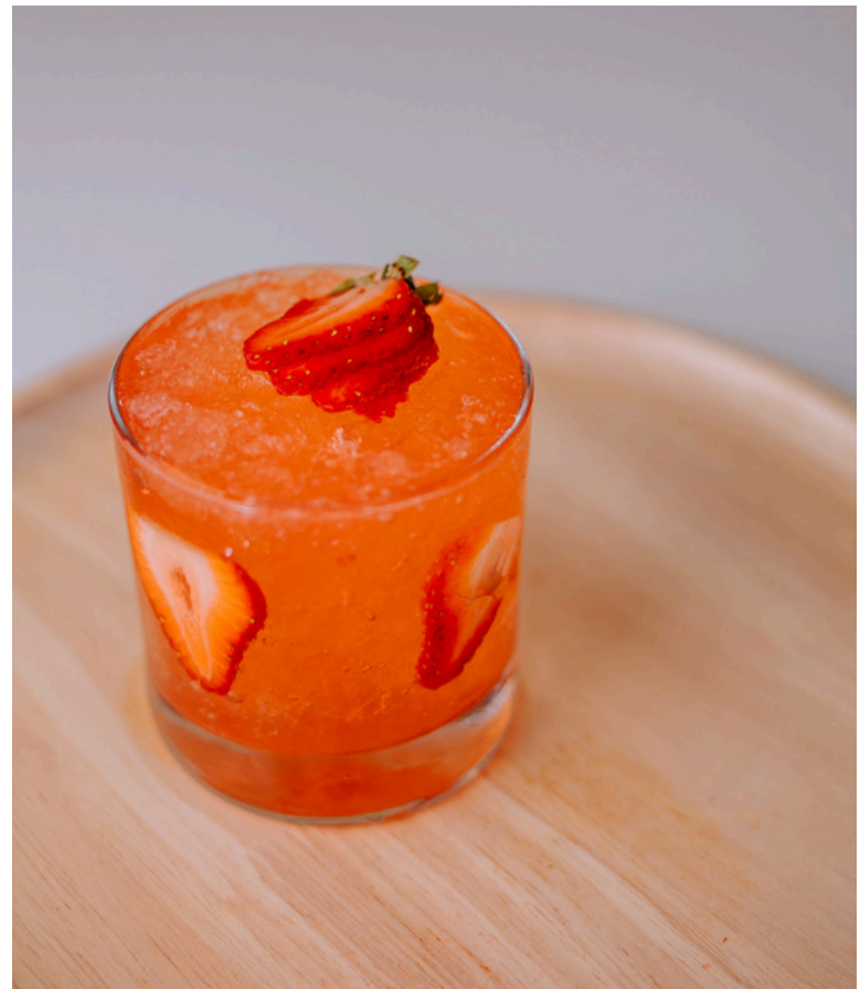
Strawberry Fields Forever

Plum Mulled Wine $5.00 plum wine | mulled wine | cranberry | sugar | mulling spices